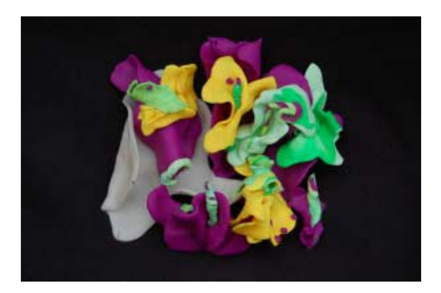
Pleasure Sculpty<sup>TM</sup>, 4" x 4"

Feeling pleasure is one of the motivators of my over eating and this makes my primary identity nervous! I wanted to explore the sense of pleasure I felt when yearning for bread and butter or fantasizing about chocolate cream pie and so made this sculpture. Making it, I worked slowly with acute attention to details in order to create very small dabs and twirls. Softening and bending the clay into folds and curls, I became absorbed in a miniature world of flower petals, fairies, and tiny caterpillars. When I look at the bright, candy like colors and curving, delicate shapes, I melt inside, breathe more deeply, and feel smooth and light like whipped cream.