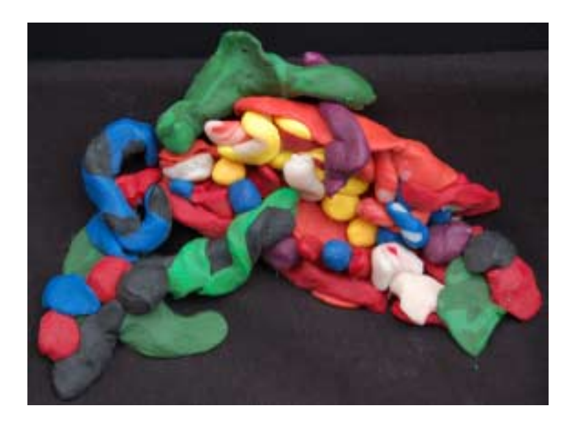
Heavy Sculpty<sup>TM</sup>, 5" x 5"

This sculpture depicts my uncomfortable, weighted down, heavy feeling after a binge. I enjoyed making chunky shapes and using a definite force with my hands as I stuck them together. I even liked using the duller, less vibrant colors that I often avoid. They had a place and purpose in this piece and I feel satisfied looking at the result. It reminds me of an experience I had while working on this project: walking down the street one day, I suddenly felt as though I had landed in my body and was seeing through my own eyes. I felt I was inhabiting the area inside my skin and skull and sensed my body as a defined mass in contrast to the air and space around me. One integration of this experience has been creating this project and performance in that I'm giving substance to my ideas, thoughts, and experiences.