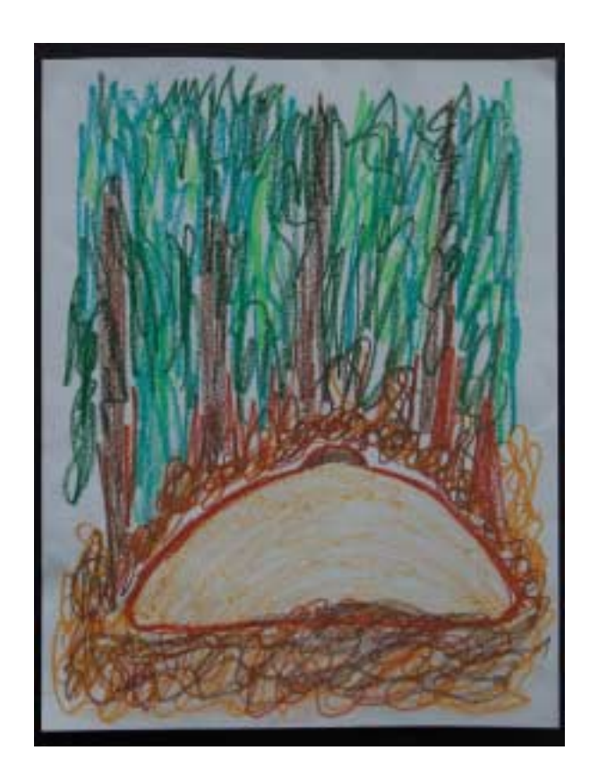
Belly Oil pastels on 18" x 24" paper

During this project I wanted to befriend my belly because I had disliked its size most of my life. One day I meditated on its round, protruding shape. Lying on my back on the floor, I experienced my belly rising up out of the earth in the middle of a forest. She was clear and calm, letting every inch of her be there, even her belly button. I experienced it as an open feeling of being part of nature.