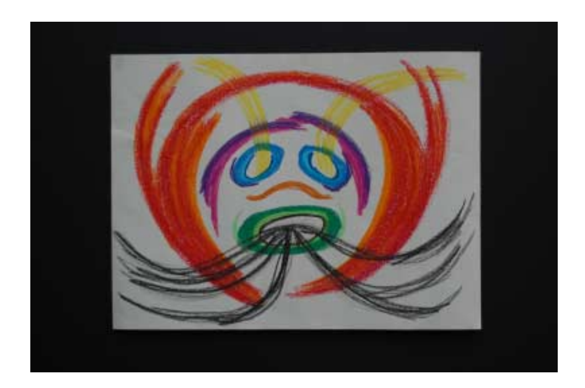
The Binge Force Oil pastels on 18" x 24" paper

This is the mask I refer to on page 14. When I dream into the spirit expressed by these colors, movement, shapes, and way, it fills the paper, and I feel something that wholeheartedly embraces whatever life offers. From the white areas I also sense a capacity to be spacious, have no shape, be unknown. For me, this image holds all that has been expressed and will be expressed in my field of binging and starving.